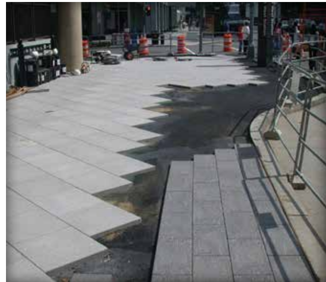
Figure 18. Paving slabs adhered to a bitumen-sand bedding in a Washington, DC, sidewalk.