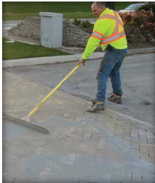
Figure 11. Sweeping in joint sand

The hot bitumen-sand bedding layer is placed, screeded to about \frac{3}{4} in. (20 mm) thick and compacted while remaining above 250° F (120° C) (Figures 4 and 5). This layer typically compacts about \frac{1}{8} in. (3 mm). The depth of this layer must be consistent. If the area does not have a curb to support a screed, screed bars are placed directly on the concrete base to guide the screed. The bars are removed immediately after screeding and the narrow void spaces left from the removed bars are filled with additional, hot bitumen-sand mix and troweled smooth. The compacted bitumen-sand bedding layer can compensate for only very small surface variations in the concrete base and cannot be used to make up for a rough surface finish on the concrete. The bitumen-sand mix is placed, screeded and compacted in one small area at a time (typically a 100 to 300 sq. ft. or 10 to 30 m 2 ) in order to screed and compact the mix while hot. Areas that can not be compacted with the roller compactor