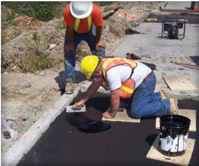
Figure 8. After the bitumen-sand mix cools, a 2% neoprene-asphalt adhesive is applied. The material can be trowel-applied as shown here. Some materials are more viscous and can be spread with a squeegee.