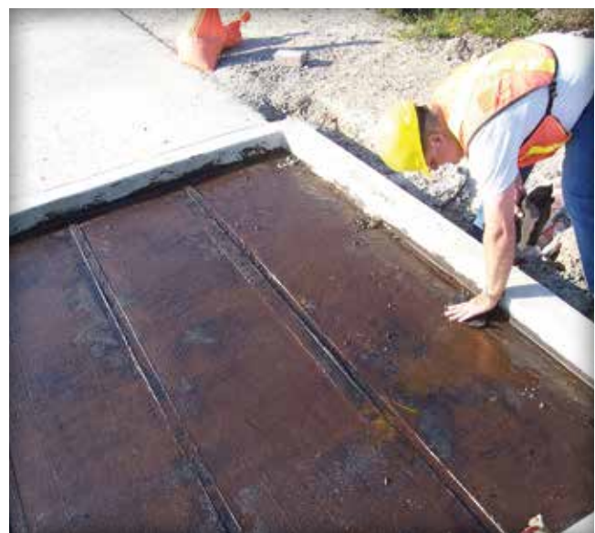
Figure 3. Confirming the tack coat has cured and is no longer wet to the touch.

Best application results are typically achieved using a synthetic paint roller with a short nap. Once applied the tack coat should not be disturbed and should be allowed to cure before covering with the setting bed material. As the asphalt emulsion cures it should turn from a brown to black color (Figure 3). This may take a few hours depending on weather conditions. When using SS-1 and SS-1h asphalt emulsions the temperature should be between 70 and 160° F (20 to 70° C) to allow for proper curing. Asphalt tack coats are recommended for vehicular applications. They are typically not required in pedestrian applications.