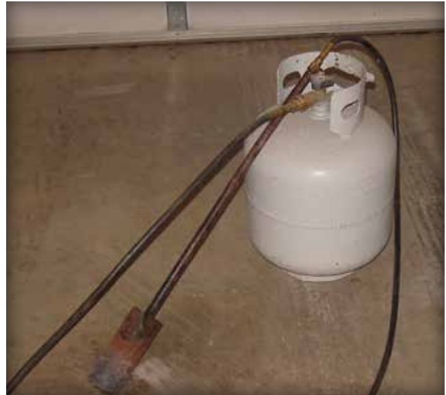
Figure 16. Occasionally, uneven bedding surface occurs and it is necessary to re-heat the bitumen-sand bedding with a propane heater tool.