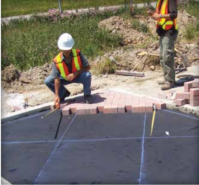
Figure 10. Cut pavers are added along the edges.

The hot bitumen-sand bedding layer is placed, screeded to about \frac{3}{4} in. (20 mm) thick and compacted while remaining above 250° F (120° C) (Figures 4 and 5). This layer typically compacts about \frac{1}{8} in. (3 mm). The depth of this layer must be consistent. If the area does not have a curb to support a screed, screed bars are placed directly on the concrete base to guide the screed. The bars are removed immediately after screeding and the narrow void spaces left from the removed bars are filled with additional, hot bitumen-sand mix and troweled smooth. The compacted bitumen-sand bedding layer can compensate for only very small surface variations in the concrete base and cannot be used to make up for a rough surface finish on the concrete. The bitumen-sand mix is placed, screeded and compacted in one small area at a time (typically a 100 to 300 sq. ft. or 10 to 30 m 2 ) in order to screed and compact the mix while hot. Areas that can not be compacted with the roller compactor