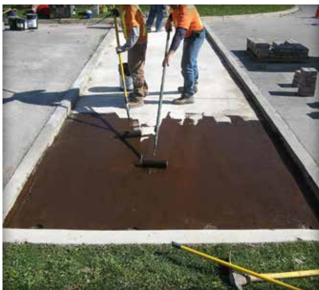
Figure 2. Emulsified asphalt tack coat is applied to a concrete base prior to applying the bitumen-sand mix.

Figures 2 through 12 demonstrate the bitumen-sand set interlocking concrete pavement installation sequence for a crosswalk. Once the concrete base is in place and cured